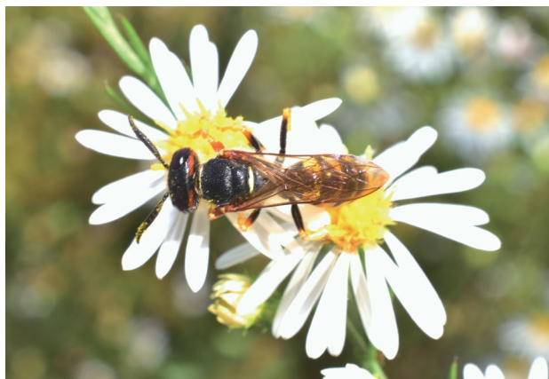
Fig. 2. Philanthus triangulum foraging on Aster pilosus Willd.

materials (658 bp) that are different in sex, coloration and size are completely identical (GenBank accession numbers: MN650651, MN650652, MN650653). Also, they are different at most 1.4% from the selected Afrotropical (from Morocco), European (from Germany, Bulgaria, and Italy), Middle East (from United Arab Emirate) and West Asian (from Turkey) materials. Pairwise genetic distances calculated among the Korean and foreign materials are tabulated in the Table 1.